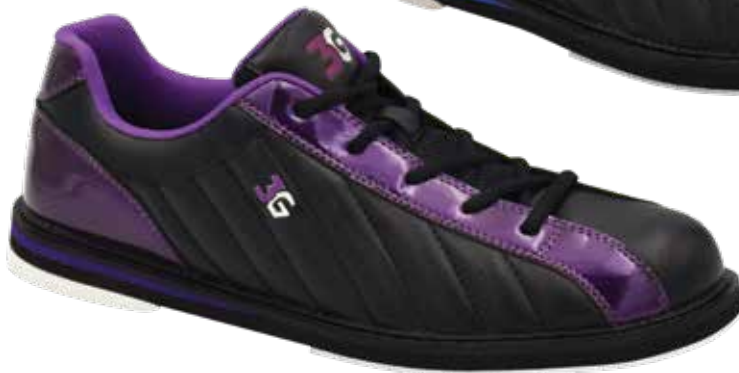
Black/Metallic Purple Unisex Sizes: 4.5-12, 13, 14 SKU: SK1000