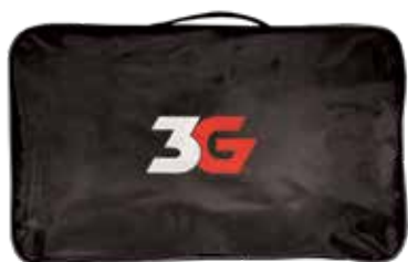
Shoe Carry Bag