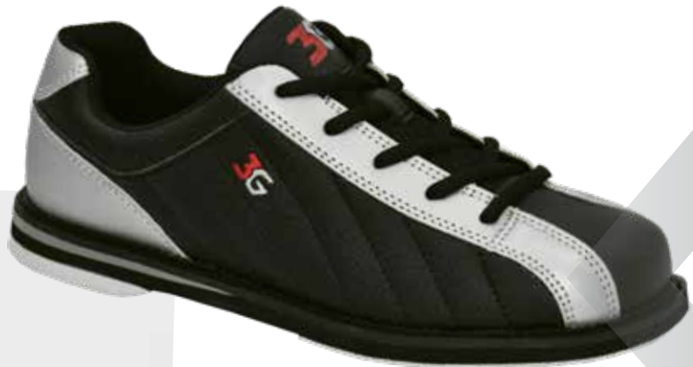
Black Textured/Silver Unisex Sizes: 4.5-12, 13, 14 SKU: SK800