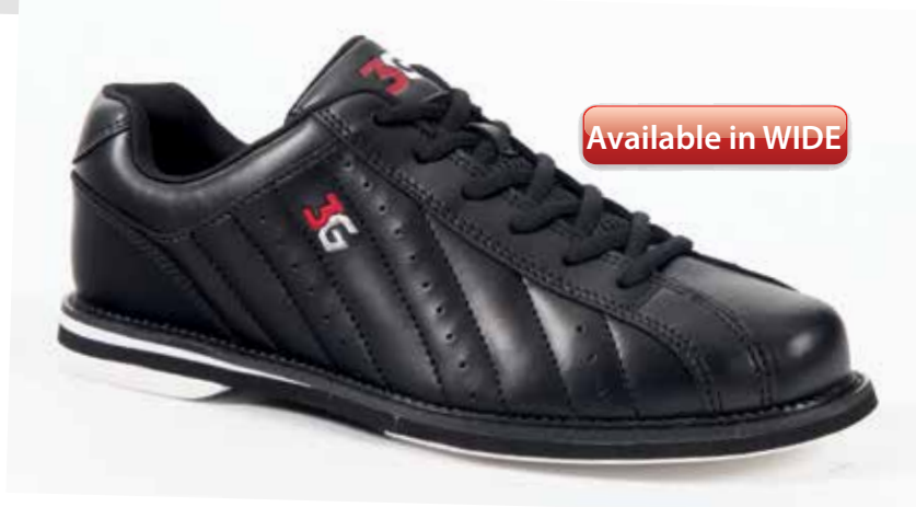
Wide Sizes: 5-12, 13, 14, 15 SKU: SK200W