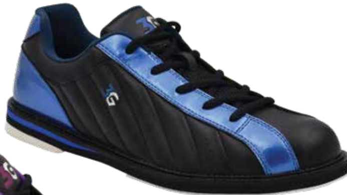
Black/Metallic Blue Unisex Sizes: 4.5-12, 13, 14 SKU: SK900