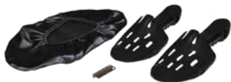
Shoe Cover (1), Shoe Trees, and Cleat Pick

Cleated Sole, Chrome Sole, Deer Skin Sole, Back Skin Sole