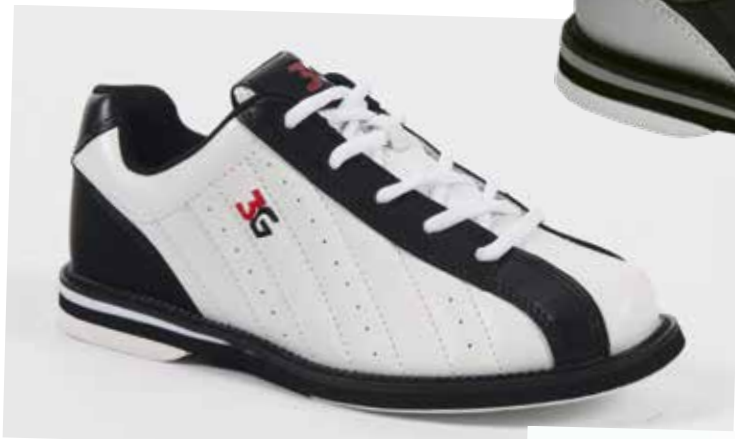
White/Black Unisex Youth Sizes: 2, 3, 4 SKU: SK100