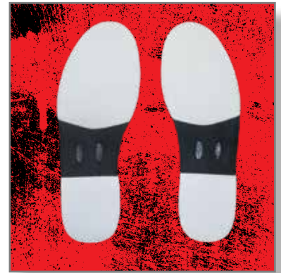
Universal Slide Soles