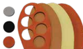
4 Interchangeable Soles

Cleated Sole, Chrome Sole, Deer Skin Sole, Back Skin Sole